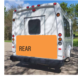
LIGHT DUTY SHUTTLE BUS